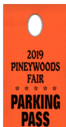
Exhibitor Parking Pass