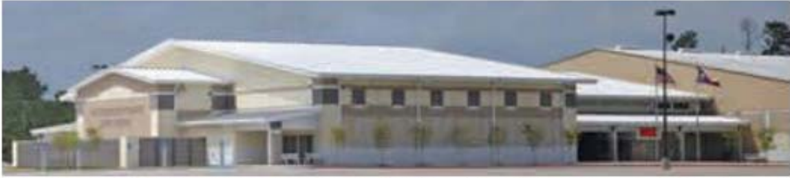
EXHIBIT “A” continued Nacogdoches County Civic Center